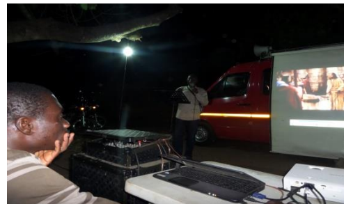
Setting up machines for film show

The church planting activities included: tract distribution, house to house bible studies, film show about the life of Christ and open air preaching. One preacher took time to tell kids bible stories each night.