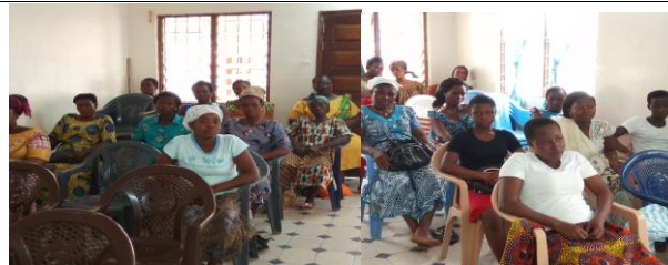
Ladies who attended the meeting

Upon my return from the US, I spent some time meeting with the ladies of the Nyiveme Church of Christ, to encourage the leaders to add some skill training programs to their weekly bible classes.