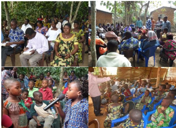
Scenes from Bible camp

The theme for this year's camp was "The Christian Family". However, I was assigned to speak on "Understanding church discipline" with emphasis on dis-fellowship. A couple of preachers were also assigned topics that related to the Theme.