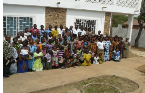
NYIVEME CHURCH OF CHRIST

leadership, but what can we do? Our plan is to raise funds to purchase land and start a church building project.